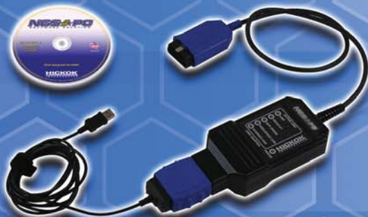
Model 90010 UMC Adapter Cable